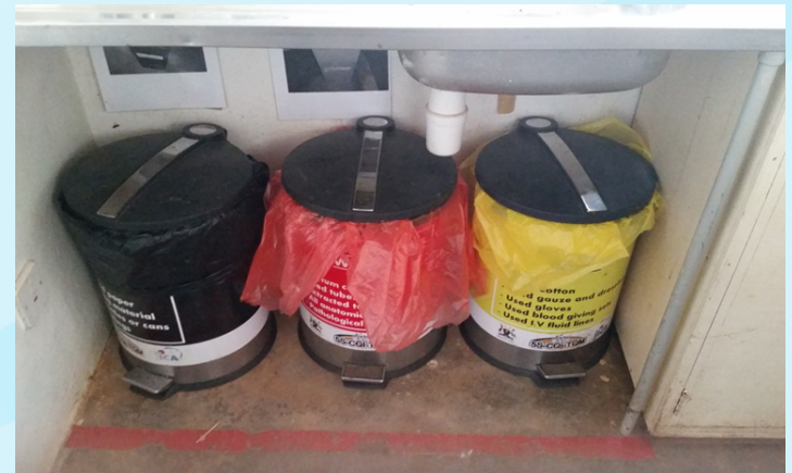
Good waste Management Practice