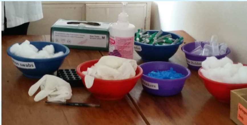
Sample collection area at PMTCT site