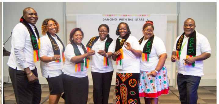
The Kenya (left) and Cameroon (right) country teams shared the SLMTA Spirit Award trophy with the host country.