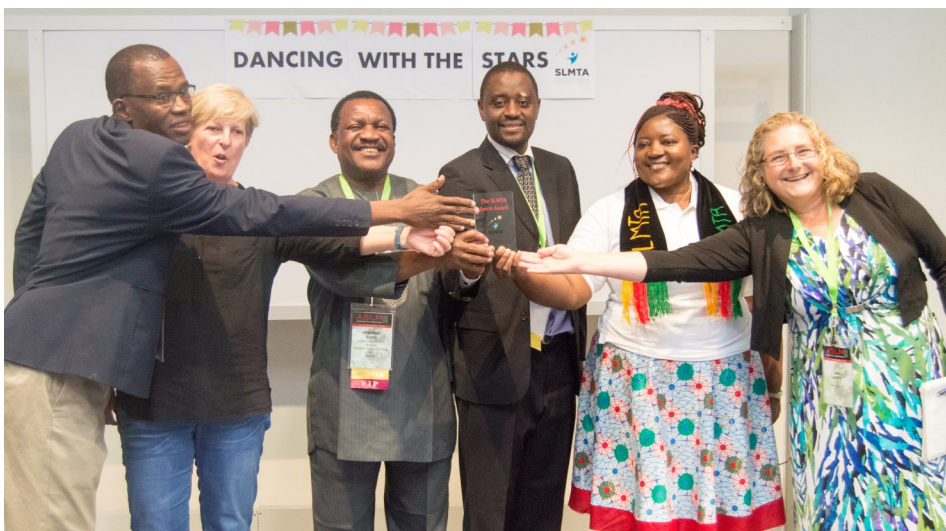
The SLMTA Spirit Award, SLIPTA/SLMTA Symposium, ASLM2016