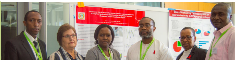
SLIPTA/SLMTA Symposium at ASLM2016, Cape Town