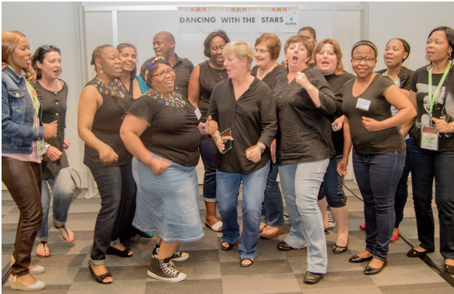
“Shosholozza “ - South Africa showcasing their SLMTA Spirit with an invigorating song and dance